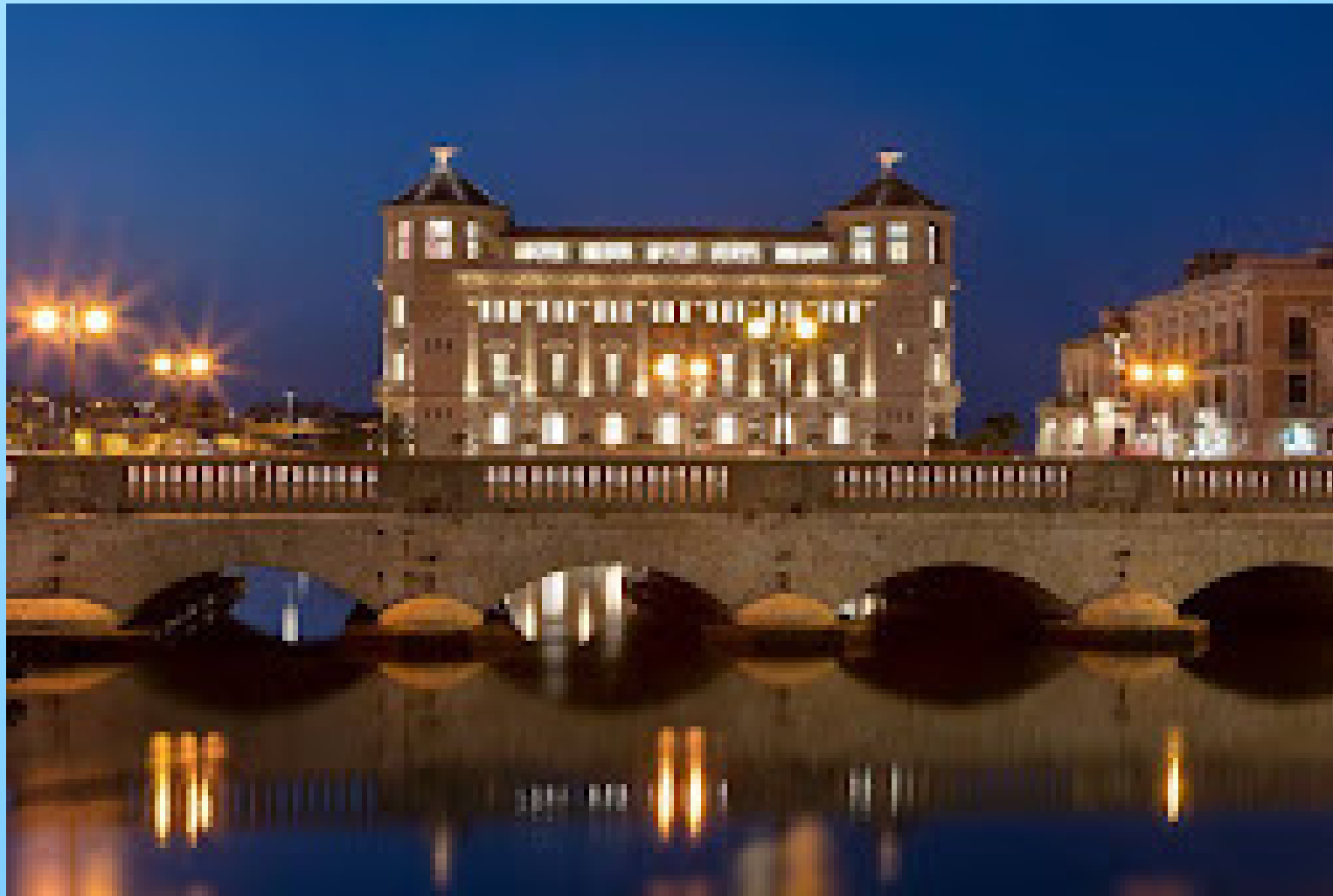
Ortea Luxury Palace Hotel

ANALYTICAL PSYCHOLOGY WHEN THE TIME IS OUT OF JOINT