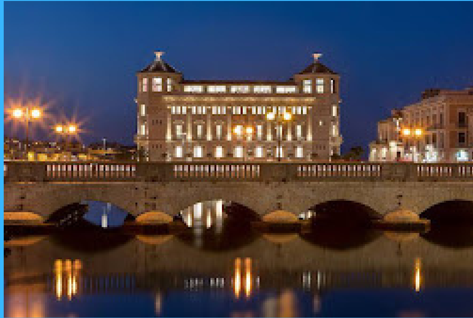
Ortea Luxury Palace Hotel

SIRACUSA 28th AUGUST 2024- 3pm 30th SEPTEMBER 2024- 1pm